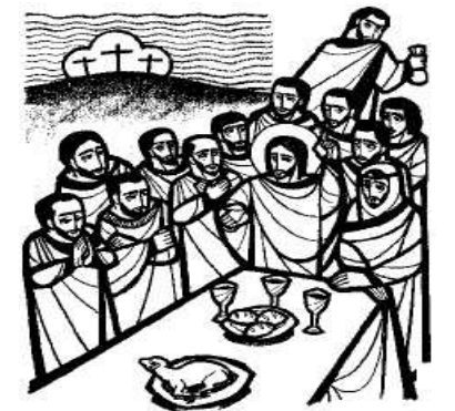
Now is the Son of Man glorified.