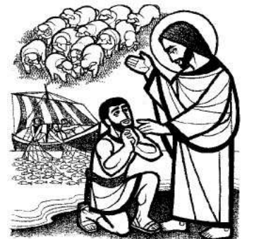
Do you love me? Feed my sheep.