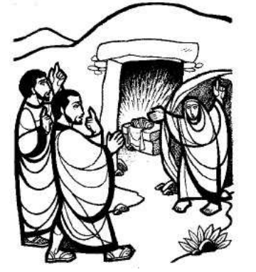
He saw and believed.