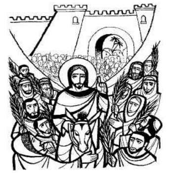
Blessed is the King who comes in the name of the Lord.