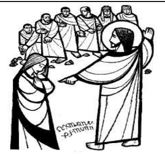
Let the one who is without sin cast the first stone.

Everyone: PLEASE arrange for a substitute if you cannot come on your assigned date!