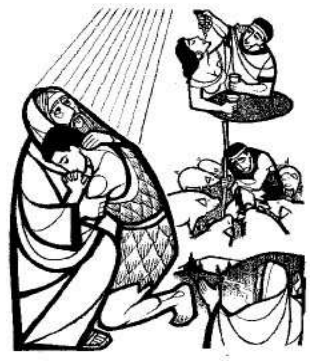
He was lost and has been found.