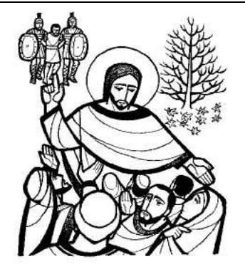
If you do not repent, you will perish.