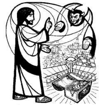
"You shall not put the Lord your God to the test."