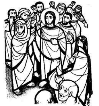
Today this Scripture passage is fulfilled.