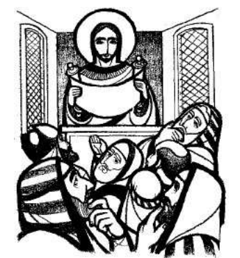
Today this Scripture passage is fulfilled.