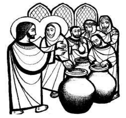
"They have no wine."