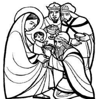
They saw the child with Mary his mother.