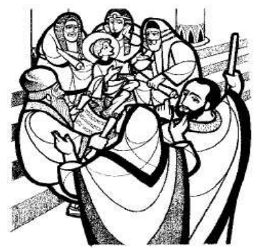
Did you not know that I must be in my Father's house?