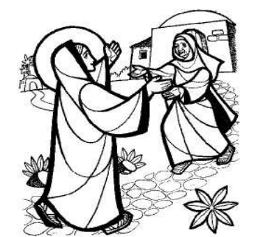
Blessed are you among women!

Everyone: PLEASE arrange for a substitute if you cannot come on your assigned date!