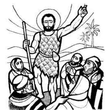
Proclamation of a Baptism of Repentance