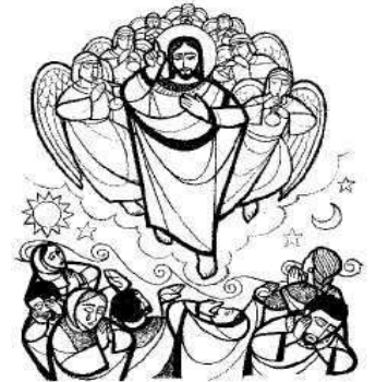
"It is you who say I am a king."