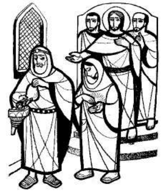
"This poor widow has put in more than all."