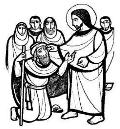
"Master, let me see again."