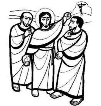
"The Son of Man came to give his life as a ransom for many."