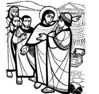
"Go and sell everything you own and follow me."