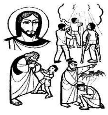
"Anyone who is not against us, is for us."