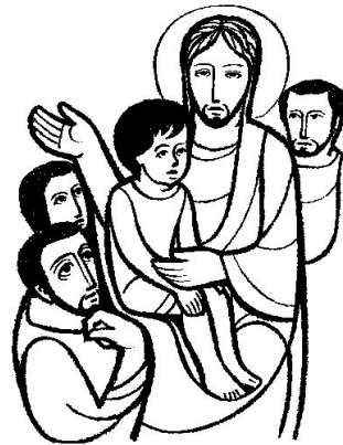
"Whoever receives one child such as this in my name, receives me."