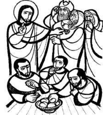
"You put aside the commandment of God to cling to human traditions."