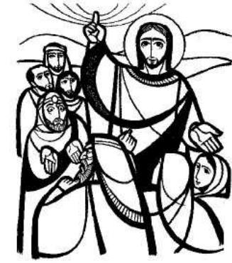
"I am the living bread which has come down from heaven."