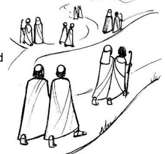
"He began to send them out."