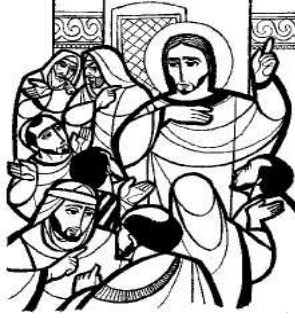
Why does ye lack faith?