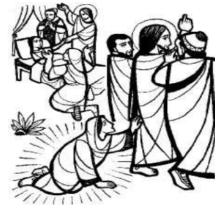
'Do not be afraid; only have faith.'