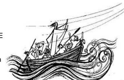
"Who can this be? Even the wind and sea obey him!"