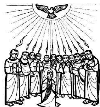
"Receive the Holy Spirit."