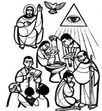
Go into the world and proclaim the Gospel.