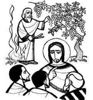
"I am the vine, you are the branches."