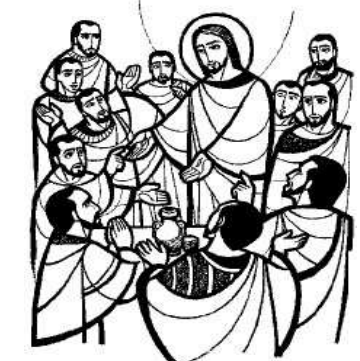
Jesus said, "See my hands and my feet, that it is I myself."