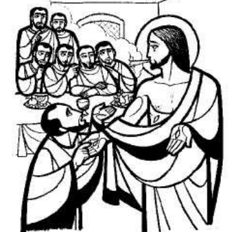
Jesus came and stood in their midst.