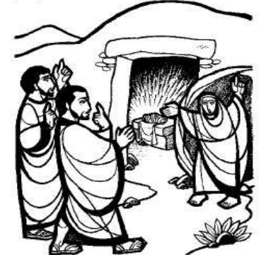
He is risen! Alleluia! Alleluia!