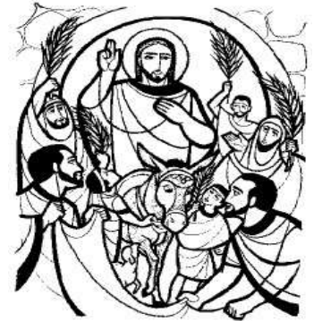
"Blessings on him who comes in the name of the Lord."