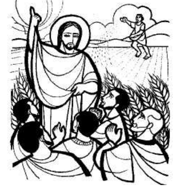
"If a grain of wheat falls on the ground and dies, it yields a rich harvest"