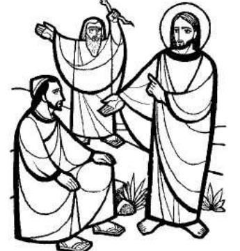
Just as Moses lifted up the serpent, so must the Son of Man be lifted up.