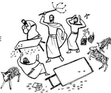
"Stop making my Father's house a marketplace."