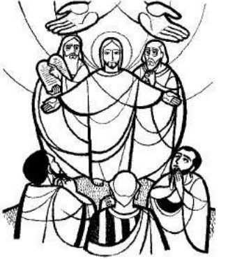
"This is my beloved Son. Listen to him"