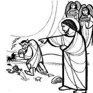
"Jesus was tempted by Satan, and the angels looked after him."