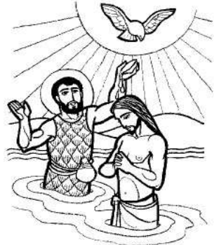
I have baptized you with water, he will baptize you with the Holy Spirit