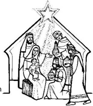
"We saw his star and have come to do the king homage."