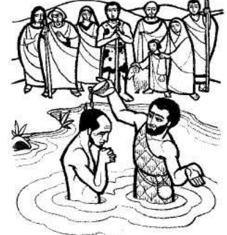
I have baptized you with water, but he will baptize you with the Holy Spirit.