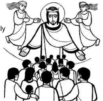
"He will take his seat on his throne of glory, and he will separate men one from another"