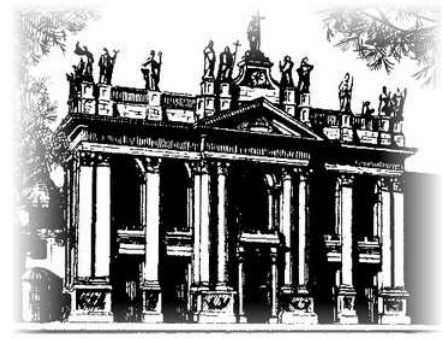
"He was speaking of the temple that was his body."