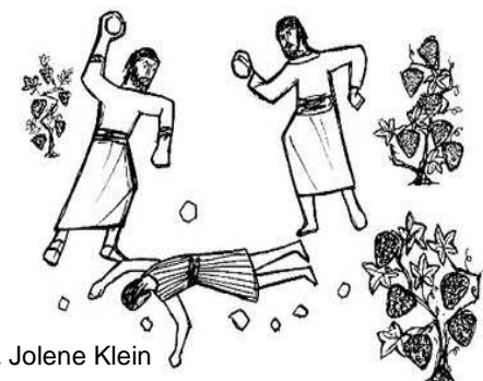
"He will lease the vineyard to other tenants."