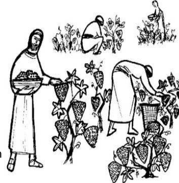
"Why be envious, because I am generous?"

JACOB'S ROOM From his room to yours ... 202 Main, Wayne, NE 402-833-5332 www.jacobsroom.com