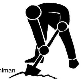
He sells everything he owns and buys the field