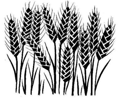
Let them both grow till the harvest