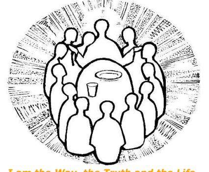
I am the Way, the Truth and the Life

Everyone: PLEASE arrange for a substitute if you cannot come on your assigned date! *EMHCS: The name underlined at the 8 o'clock Mass will take Communion to the Nursing Home. The name underlined at the 10 o'clock Mass will take Communion to the Oaks. The name with the * by it will take Communion to shut-ins. The name in parentheses is an alternate, in case another EMHC cannot show up as assigned.